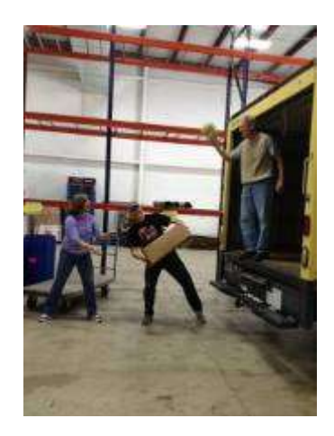
Boxes are being unloaded!